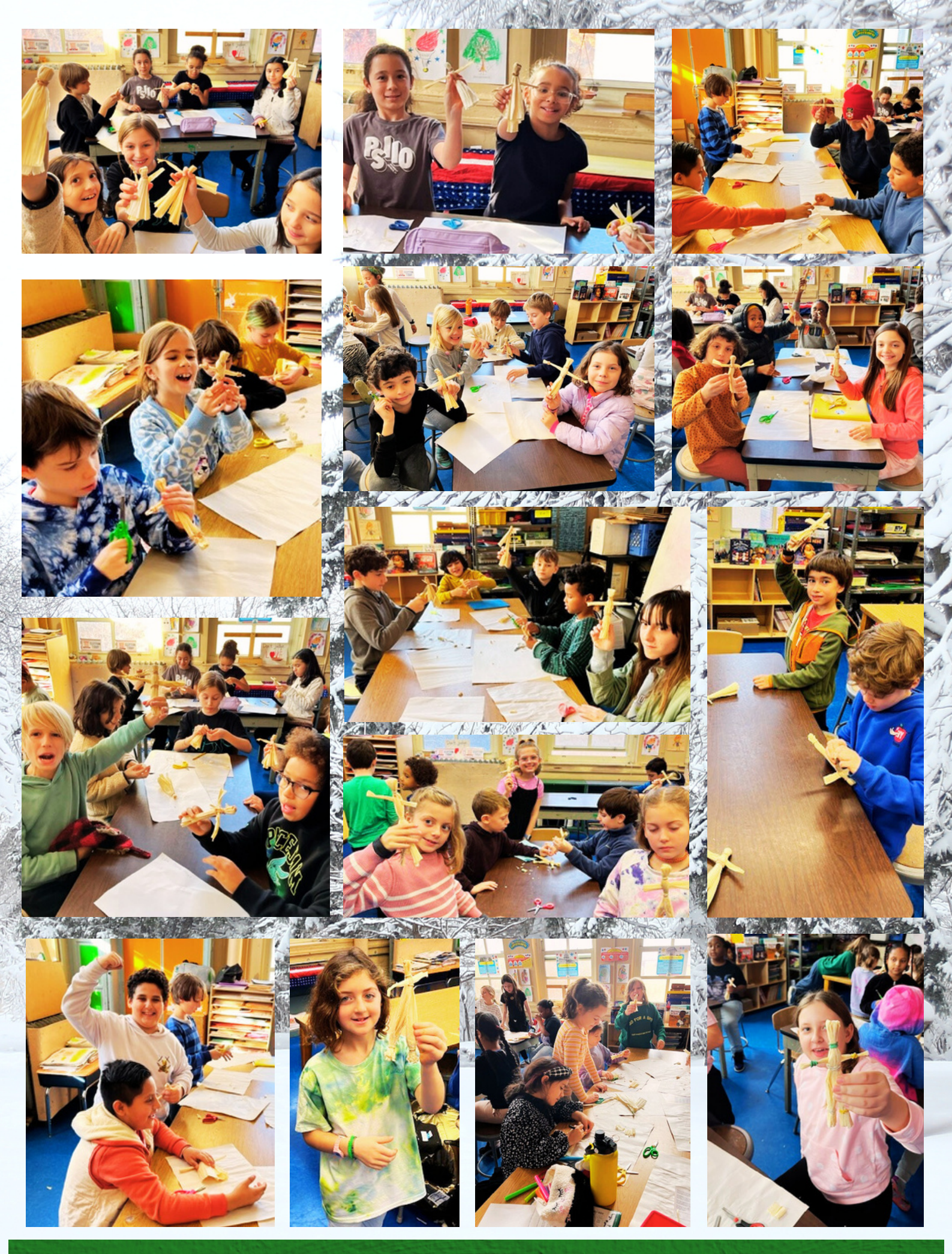
Corn Husk Dolls represent the selflessness we should all strive to have. Students had so much fun crafting them out of real, dried-out corn husks and a few rubber bands. They also learned the husks can be used to cook food inside of, such as when you're making tamales, a traditional Mexican dish!